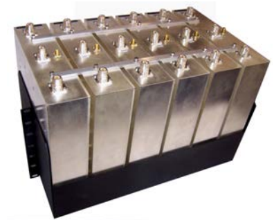
Picture of Duplexer Assembly, CCFA-239